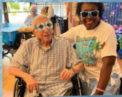
Summertime means Shark week!